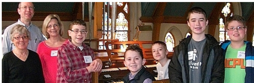
Pedals, Pipes and Pizza 2014

February and March have been busy months for our chapter!